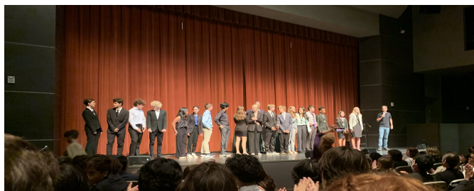
Novice PF teams with a 3-1 record stand on stage

A: We spent a lot of time revising cases, and we got outside help from captains and peers. We also made sure to do our blocks, which really payed off.