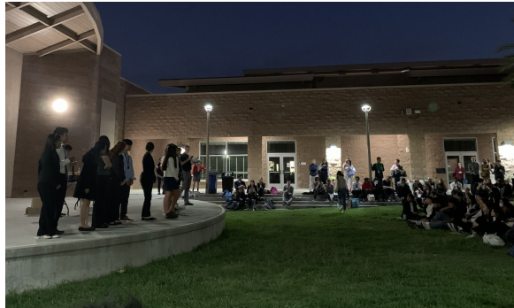
Finalists for novice Congress standing on the stage and receiving their medals